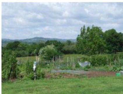
Allotment Gardens Higher Ridgeway

Open Spaces and Recreation There are a number of valued open spaces together with “amenity” land in and around Ottery St Mary Town. Sites at Canaan Way Recreation area, Winters Lane Playing Fields and Tennis Courts, the Football ground off Butts Road, Ottery Cricket Club and the Bowls Club off Strawberry Lane, the Primary School Playing field and the King's School Playing field all provide excellent facilities. The Millennium Green near St Saviours Bridge offers beautiful views and walks beside the River Otter. Of these open areas only Canaan Way, Winters Lane and the Millennium Green are available for use by the general public. The Allotment Gardens and Town Cemetery are situated at Higher Ridgeway to the east of the town.