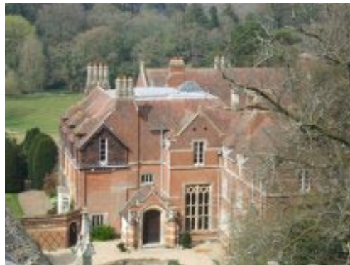
Chanters House, Birthplace of Samuel Coleridge