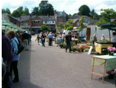
Farmers Market Hind Street Car park

A wide variety of retail shops and services exist in the town together with a monthly Farmers Market offering local produce. The town has long flourished as a market and manufacturing centre, but like many others in Devon at the time, was swept by great fires in 1767 and 1866.