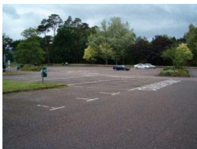
Land of Canaan Car Park

Highways and Traffic – There are five roads which all lead into the centre of the town often causing severe traffic congestion at Silver Street, Broad Street, Jesu Street and North Street. The B3177 comes into the town centre from Honiton and the main A30, often carrying heavy traffic to and from the popular Otter Nurseries. The B3174 comes into the town from Honiton, East Hill, Seaton, Beer and Lyme Regis which again causes congestion in Yonder Street and Jesu Street due to on road parking and unloading. There are three EDDC Pay and Display Car parks in the town at Canaan Way, Brook Street and Hind Street.