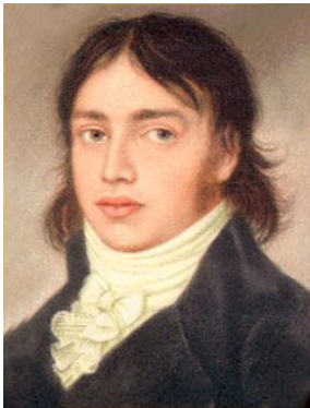
Samuel Taylor Coleridge