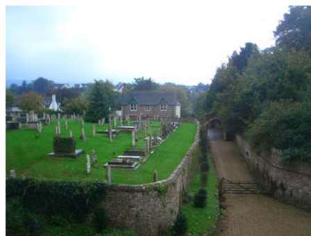
Churchyard of the Parish Church

The churchyard of the Parish Church contains several fine trees including some ornamental species. There are well established hedgerow trees close to the northern entry into the Conservation Area.