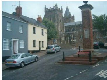
Parish Church from Silver Street

Parish Church Setting By contrast this part of the town is of exceptional quality in terms of historic interest, townscape and spatial arrangement of buildings.