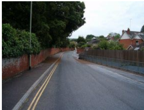
Hind Street showing brick wall

Boundaries Hind Street is largely enclosed by brick walls at its eastern end.