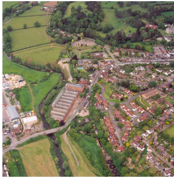
Aerial view Ottery St Mary

surround it to the north and west. At the beginning of the 19 th century it was the largest town in East Devon and even the 1891 census indicates that it was the second largest apart from Exmouth (8,097), having a slightly larger population (3,758). Compared with other towns it has not therefore expanded so rapidly this century, although much post 1945 development has occurred, mainly to the south and east of the historic centre. The decline of its textile industry, loss of rail communication and location away from existing main transport routes probably partly accounts for this.